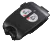
PowerG Wireless 2-Button Key (PGx949)