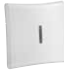
PowerG Wireless Repeater (PGx920)