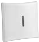
PowerG Wireless Indoor Siren (PGx901 BATT)