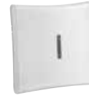
PowerG Wireless Host Transceiver Module (HSM2HOSTx)