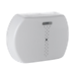
PowerG Wireless Glass Break Detector (PGx922)