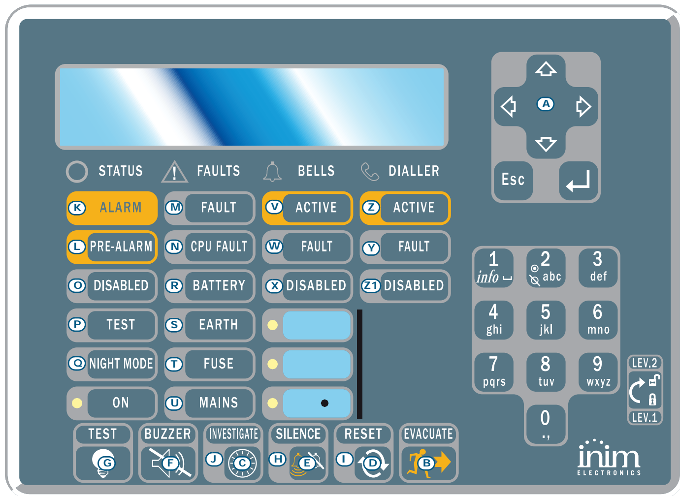
Figure 2 - Front view of the repeater panel

Connected repeater panels replicate all the information provided by the control panel and allow access to all Level 1 and 2 functions (View active events, Reset, Silence, etc.), but do not allow access to the Main menu.